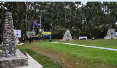
The Kokoda Plateau memorials at One Tree Hill