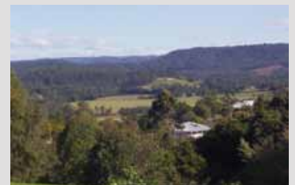
The view from the park on the side of Mt Ninderry, near Yandina, Queensland

The redoubtable Stan Bisset was the prime mover behind the development of the park, which acknowledges the links between the battalion and this area of Queensland, forged 70 years ago, when the battalion was posted here for training and coastal defence in the months following their return to Australia from the Middle East.