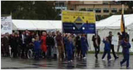
Kingsbury Primary School students assisting with the banner.