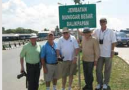
The team at Manggar Bridge

The group also visited a number of other significant sites around Balikpapan including Parramatta Ridge, the 2/14th landing site at Yellow Beach, Kampung Batu (Petrosea) on the Makassar Strait, where the 2 Japanese guns that strategically covered the harbour entrance, and are still in place, and Manggar Bridge and Manggar Beach, where the 2/14 ultimately set up camp and headquarters.